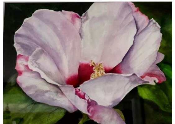
Bobbie Downs Caton – CFHS Class of '66